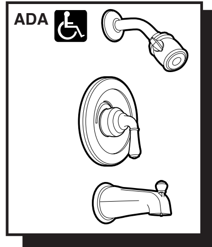
MONTICELLO® POSI-TEMP® Single-Handle Tub/Shower Valve

Models: 82240PM, 82246, 82248, 82248BN, 82250, 82250PM, 82250ST, 82253ST, 82254, 82301ORB