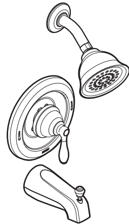
CALDWELL™ Single-Handle Tub/Shower Trim Kit